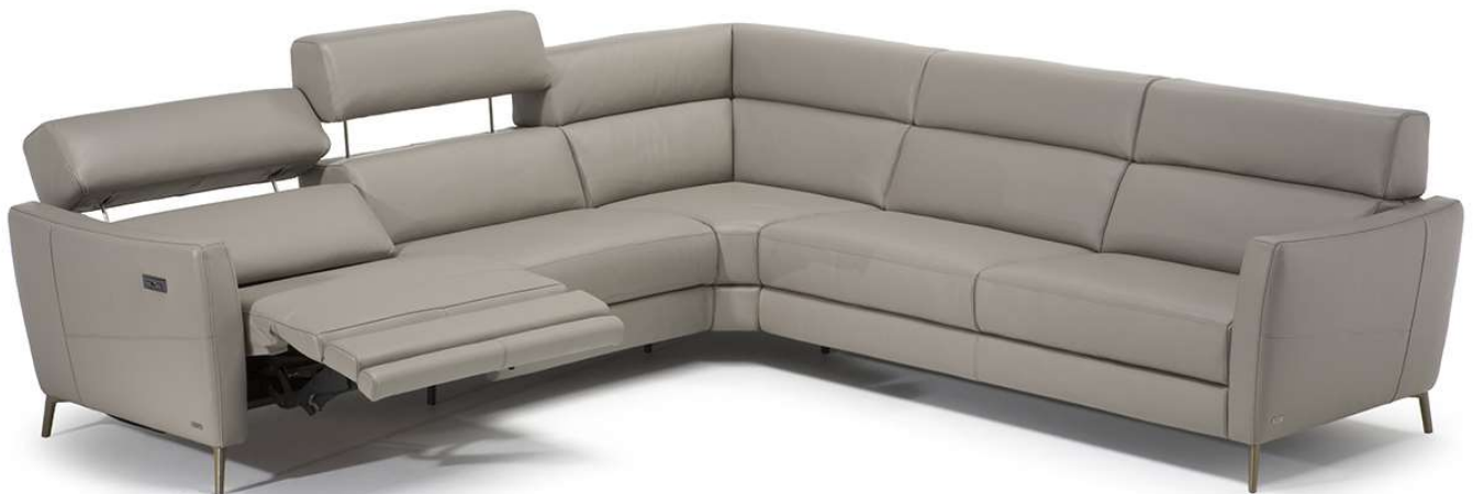
■ Vers. F50+F38+011+019