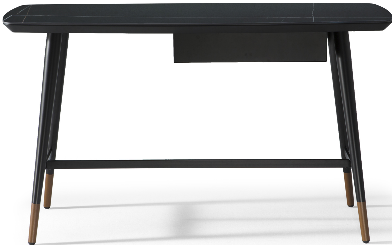
■ G22603X / G22605X