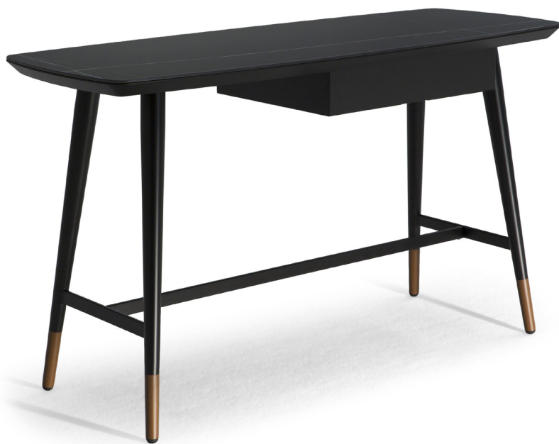
■ G22603X / G22605X