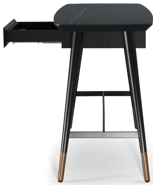
■ G22603X / G22605X

ALL PICTURES SHOWN ARE FOR ILLUSTRATIVE PURPOSE ONLY. ACTUAL PRODUCT MAY VARY DUE TO PRODUCT ENHANCEMENT.